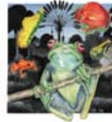
A Conservation Strategy for the Amphibians of Madagascar

A Conservation Strategy for the Amphibians of Madagascar (ACSAM) is a project designed to achieve the conservation of the amphibians of Madagascar. ACSAM is a monumental effort by committed individuals that represents an important step forward in implementing the ACAP at the national level. The ACSAM has the potential to serve as a model for developing National Action Plans for amphibian conservation in many other parts of the world. News about the ACSAM can be downloaded at www.sahonagasy.org .