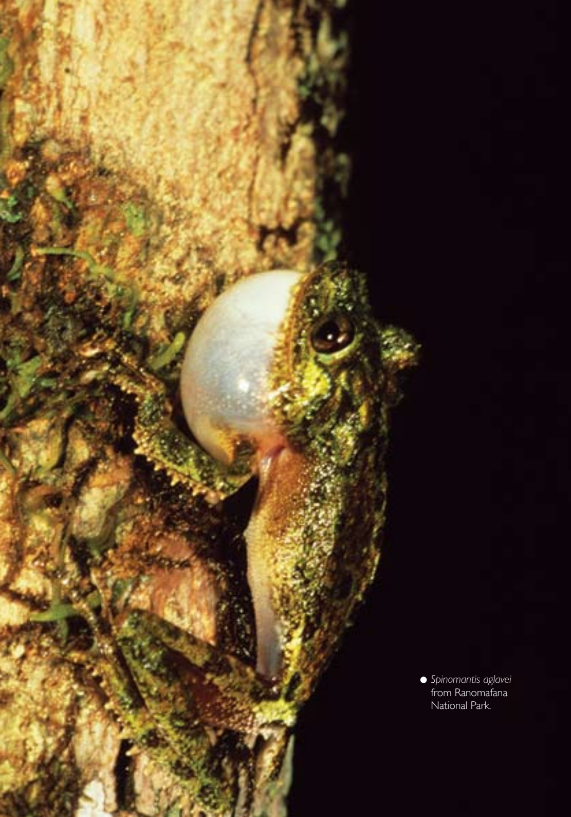
● Spinomantis aglavei from Ranomafana National Park.