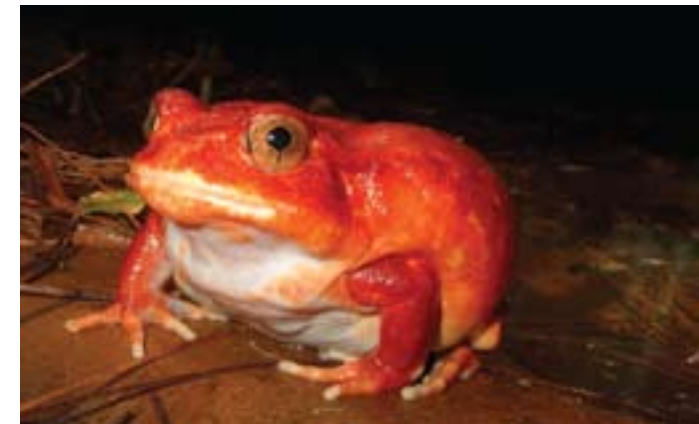
▲ Boophis ankaratra .

surrounded by farm land that is unsuitable habitat for frogs to either cross or live in. It is these isolated populations that face the greatest threat of extinction.