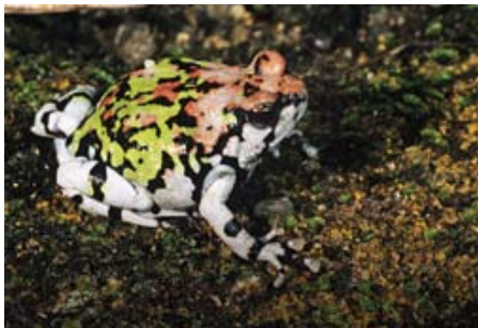
▼ Scaphiophryne gottlebei . This species, named "rainbow frog" for its wonderful colouration, is one of the endemic frogs of the Isalo, an arid sandstone massif in southern Madagascar.

ours for protection but use camouflage instead. Some Malagasy species take their camouflage to an extreme, not just having colour that matches their environment but skin that mimics lichen and plants (such as Boophis lichenoides and arboreal species of the genus Spinomantis ).