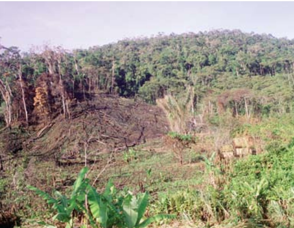
► One of the last rainforest parcels in the Tolongoina area, SE-Madagascar. Here it was discovered one of the most threatened species of frogs, Mantella bernhardi .

The more aquatic species seem to be less vulnerable to habitat conversion as they can survive in most waterways, providing there is very little pollution and as long as there is rainforest nearby, preferably gallery forest lining the riverbank. Those species that are adapted to arid areas are naturally tougher and more used to seasonal changes in their surroundings and are more resilient to habitat