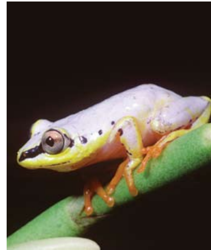
▼ The widely distributed and still abundant Heterixalus madagascariensis is a frog preferring open and savannah habitats, and does not penetrate the close rainforests.

water. When developed, the young tadpoles wriggle free of the egg clump and drop into the water to continue to develop into froglets.