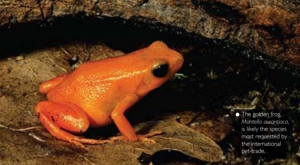
● The golden frog, Mantella aurantiaca , is likely the species most requested by the international pet-trade.

One of the most distinctive features of several species of Malagasy frogs is their bright colours. Many animals throughout the world use colour to advertise their distastefulness to predators, for example poison dart frogs from South America. These warning colours are referred to as aposematic. The colourful members of the family Mantellidae in Madagascar such as Mantella aurantiaca and Mantella baroni produce alkaloids in their skin; toxins which are distasteful to predators. Many scientists have suggested that the frogs gain the poison from a diet of insects such as ants, which contain alkaloids. However, some frogs don't rely on bright warning col-