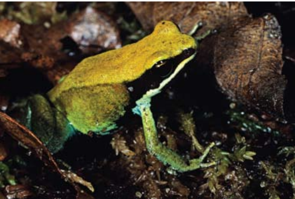
▼ The green mantella, Mantella viridis , is one of the critically endangered species of Malagasy frogs.

● Forest streams are the natural habitat of great part of Malagasy frogs: in some rainforests is indeed possible to identify up to 80-100 species.