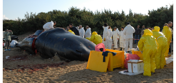
The task force for strandings of large cetacean working on a sperm whale (12/2009).

Development of equipment, protocols, guidelines, interdisciplinary approaches and capacity building have been pursued to provide Italy with a task force able to implement the Habitat Directive and to anticipate the implementation of the Marine Strategy.